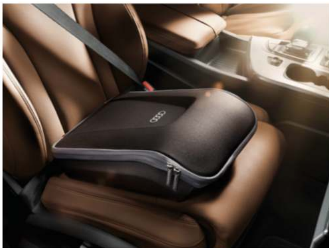
Business case All models