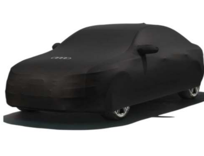
Outdoor car covers Most models