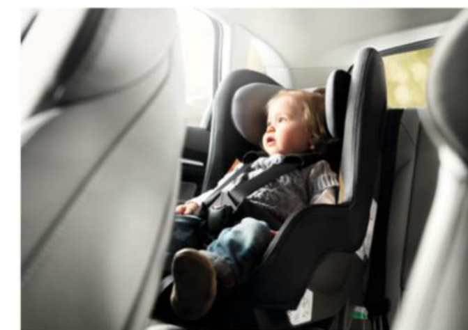
Audi child seat All Models