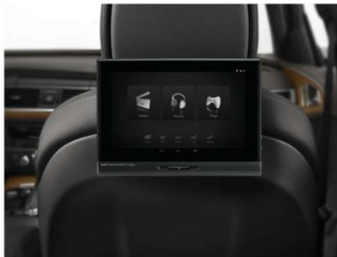
Audi Entertainment mobile (Gen. 3) For Q7 and A4