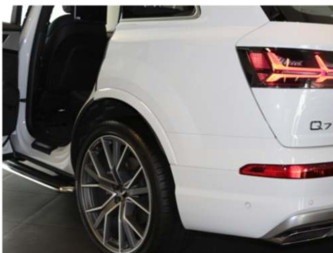
Side running boards & rear lights For the Q7