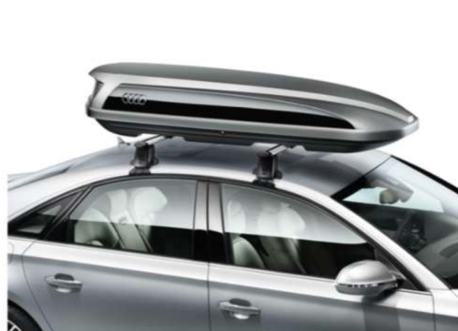
Luggage boxes Most models