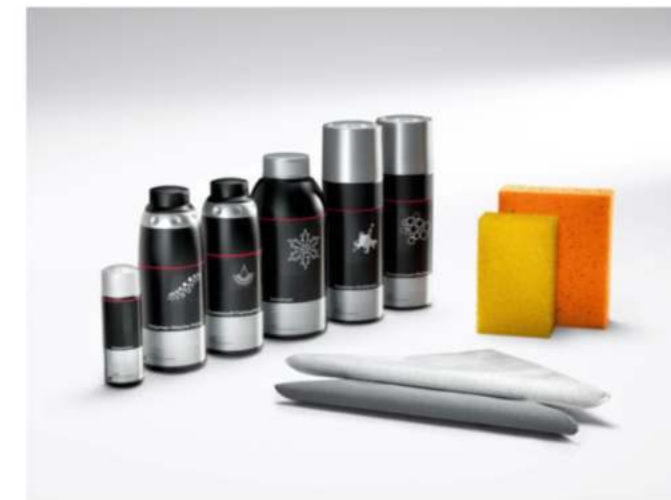
Genuine care products All models