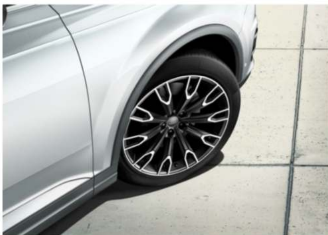
21 Talea design Rims For the Q7