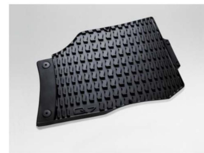
Floor mats Most models

Please ask your Service Advisor or directly at the parts counter in our dealership for further details and the entire product range of Audi Genuine Accessories.